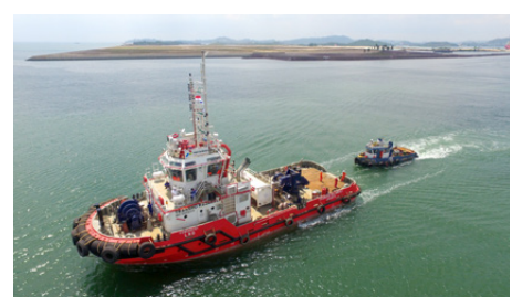
Dual Fuel LNG Tug