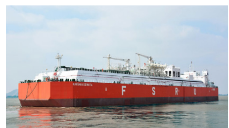
26,000cbm Floating Storage Regasification Unit