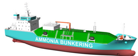
Ammonia Bunkering Vessel