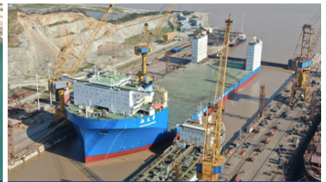
China's largest semi-sub docking

We position ourselves as a strategic partner, fostering collaborative relationships with our clients to manage a diverse portfolio of repair projects. Our highly qualified team prioritizes safety and operational excellence, ensuring the successful execution of all tasks, from routine maintenance to complex repair undertakings.