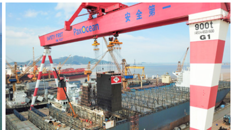
Scrubber Retrofit for 12,600TEU Container Ship

We offer innovative ballast water treatment systems and SOx scrubber retrofit solutions, ensuring maritime compliance and environmental protection, while improving vessel operational efficiency.