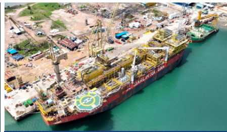
Conversions of FSO to FPSO